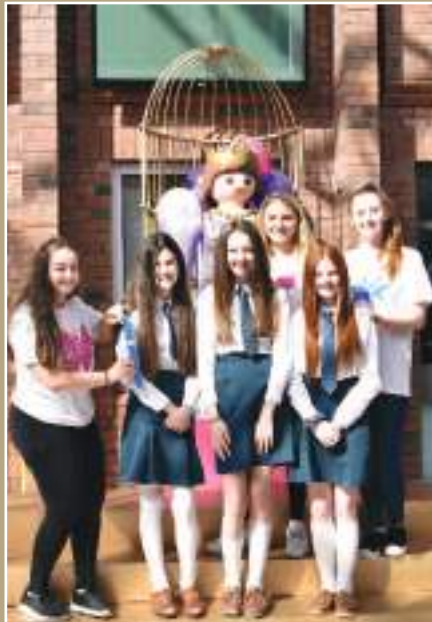
LITTLE PRINCESS TRUST