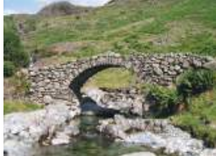
MOASDALE - LAKE DISTRICT