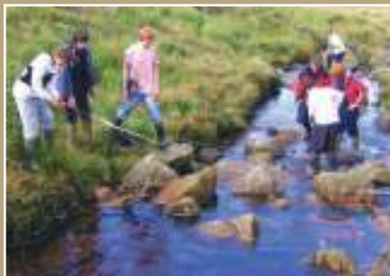
GEOGRAPHY FIELD STUDY