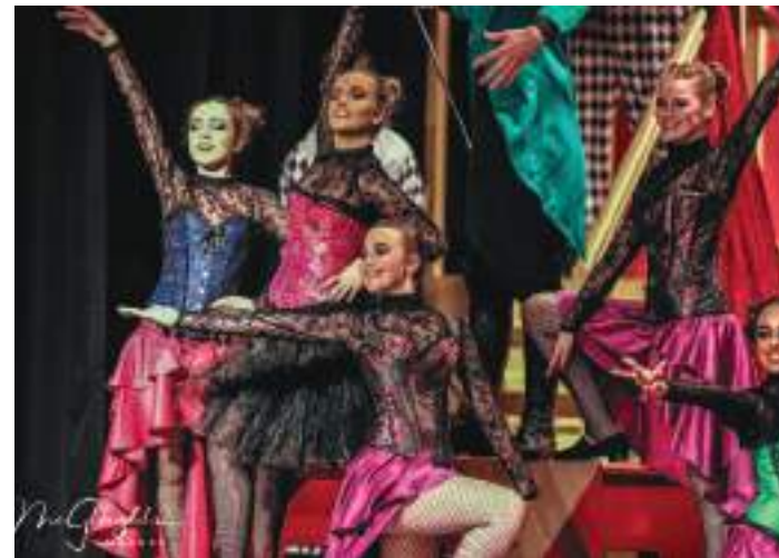
THE GREATEST SHOW

Music continues to thrive in Banbridge Academy as exemplified by our award-winning Girls' Choir and the quality and popularity of annual musical events, such as the Spring Concert.