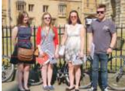
ASPIRING OXBRIDGE APPLICANTS