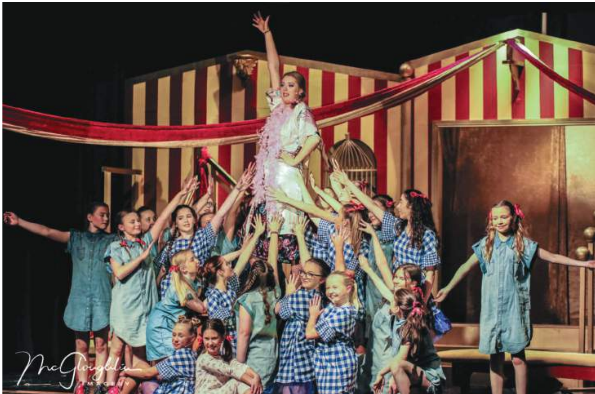
THE GREATEST SHOW