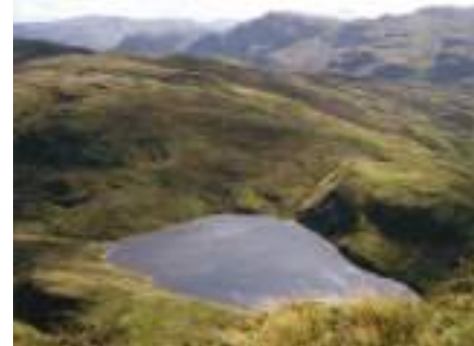
A TARN - THE TROSSACHS