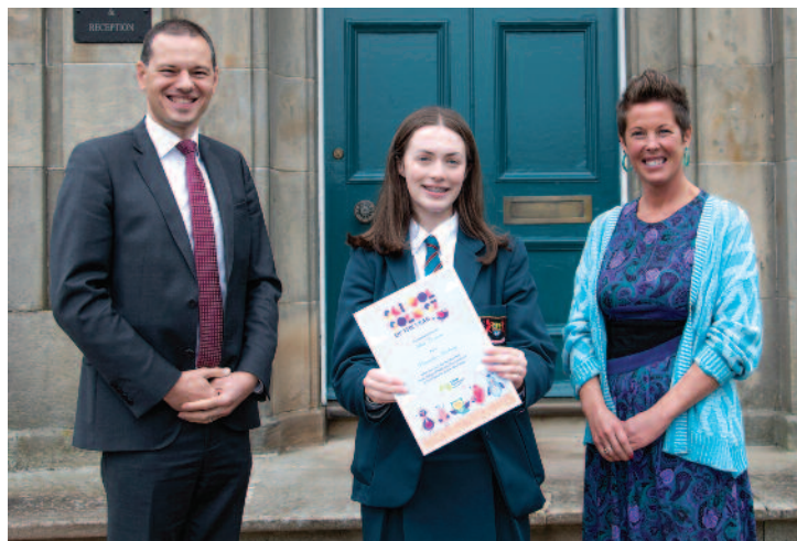
School Soloist of the Year Finalist.