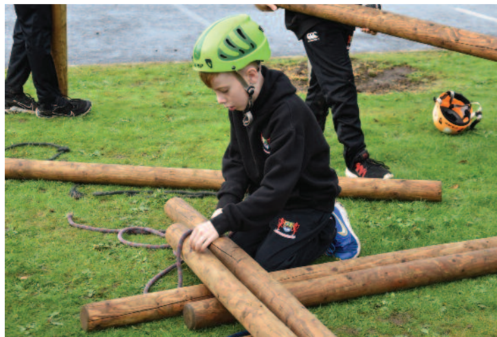
Adventure Day at Banbridge Academy.

carefully assessed by the Principal and Chairman of the Education Committee, taking into account the appropriate documentary evidence.