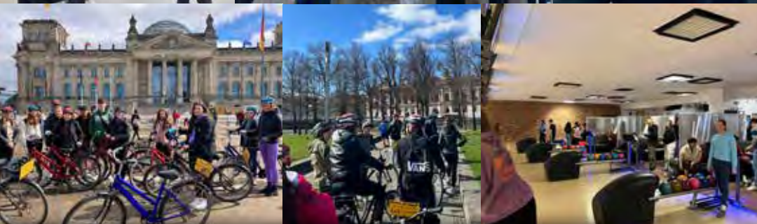
A tour of Berlin on bikes followed by an evening of competitive bowling on Day 4!