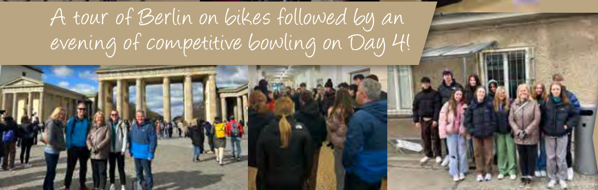
A busy last day visiting the Brandenburg Gate, the Stasi Prison Museum and a final meal together at the Hard Rock Cafe!