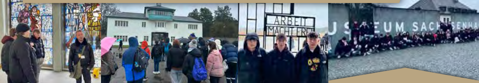
A moving day at Sachsenhausen as we reflected on the mistakes of the past and the responsibility to ensure they are never repeated.