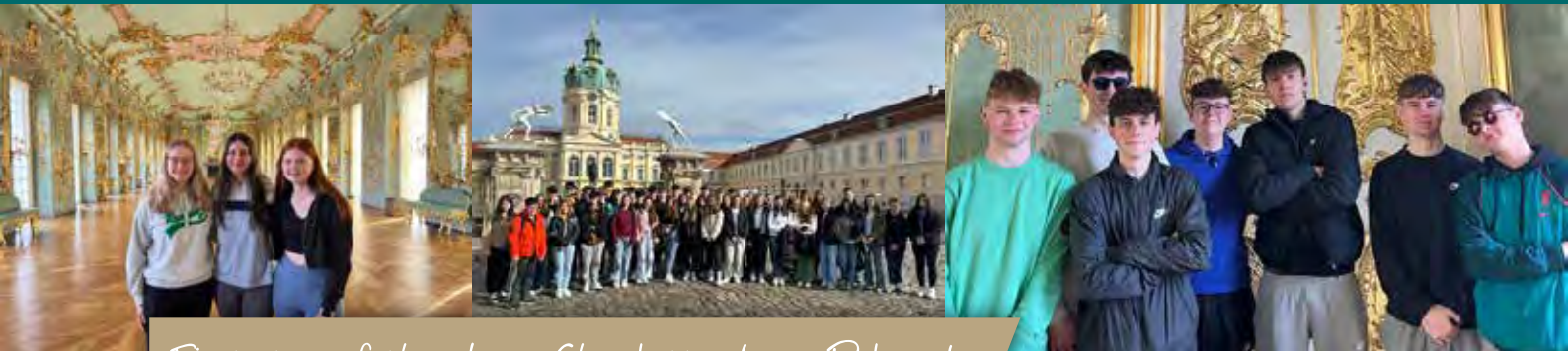
First stop of the day- Charlottenburg Palace!