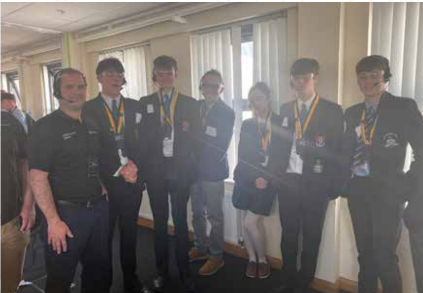
In June our pupils visited Collins Aerospace in Killeel, along with students from Dromore High School and St Patrick's College, they got to experience first-hand how the company manufactures world class aircraft seating products and the processes that are involved in doing so.