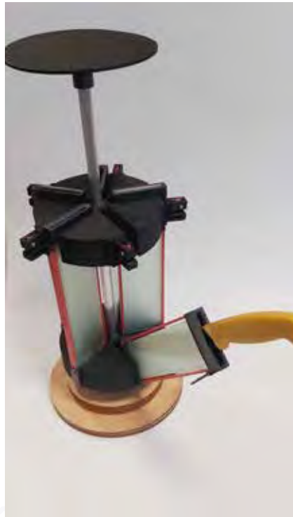
Darragh Knox - Year 13 - Locking knife block