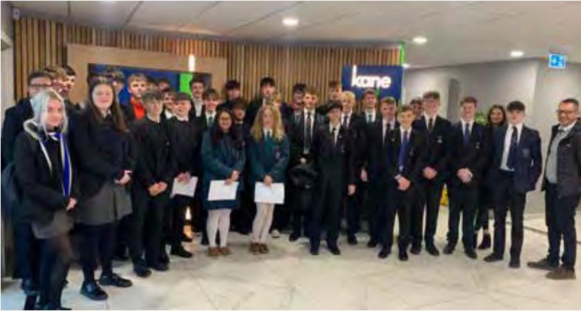
During their visit to the KANE Group our Year 13 Technology and Design students got to observe the use of 3D CAD and Virtual Reality as well as the welding, fabrication and Assembly section.