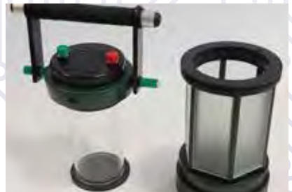
Will Egerton - Year 13 - Camping torch