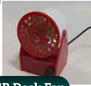
USB Desk Fan