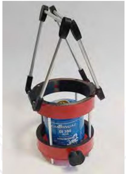
Jackson Sibbett - Year 13 - Portable camping stove