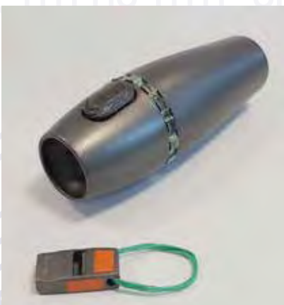
Harry McCready - Year13 - Torch with adjustable light and whistle