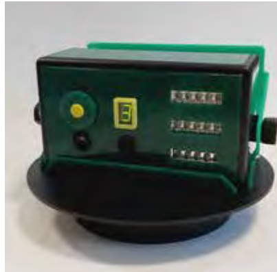
Caelon Lennon - Year14 - Oil level alert