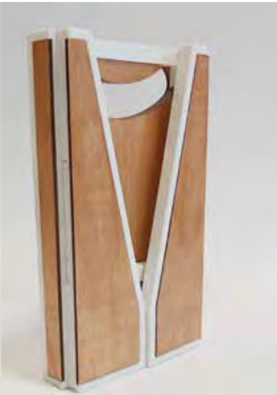
Aleyah Peniero - Year 13 - Foldable grater